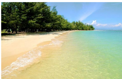
Tunku Abdul Rahman Marine Park

The Museum is sited on 17 ha at Bukit Istana Lama in Kota Kinabalu. The complex contains not only the museum exhibits, but also an ethno-botanical garden, a zoo, and a heritage village.