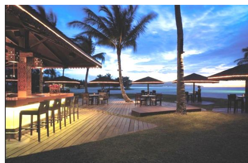
Shangri-La's Rasa Ria Resort

Kinabalu Park which cover an area of 754 sq km was gazetted a park in 1964. Its main feature is Mount Kinabalu (4,095.2 m), the highest mountain between the Himalayas and New Guinea.