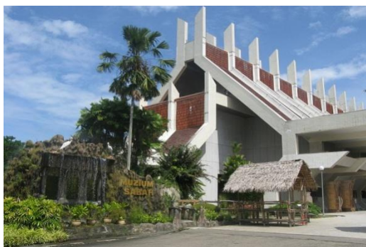
Sabah State Museum

The Museum is sited on 17 ha at Bukit Istana Lama in Kota Kinabalu. The complex contains not only the museum exhibits, but also an ethno-botanical garden, a zoo, and a heritage village.