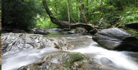
Khao Phra Thaeo Wildlife Sanctuary