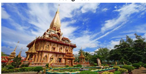
Wat Chalong Temple