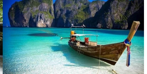
Phi Phi Island