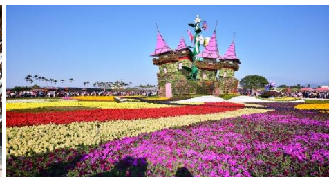
Taichung Flower Land