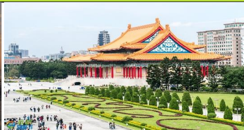
Chaing Kai Shek Memorial Hall