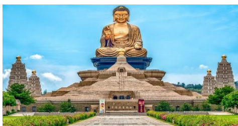
Buddha Statue Kaohsiung