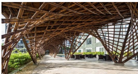
Vinata Bamboo Pavilion