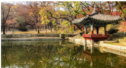
Secret Garden Hangdeokgung