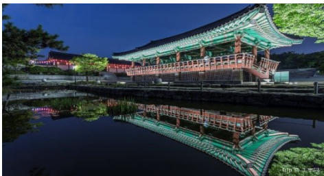
Namsangol Hanok Village