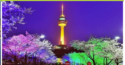
N Seoul Tower