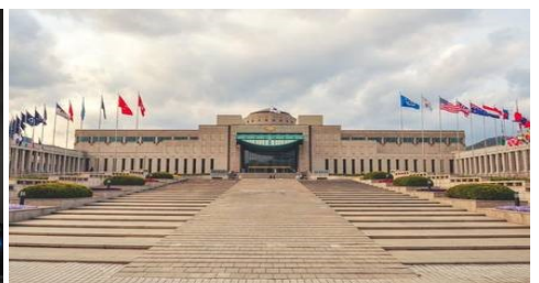
War Memorial of Korea