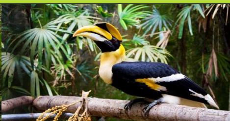
Bird Paradise Wildlife Park