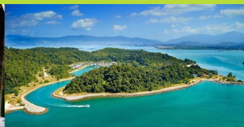
Rebak Island Resort