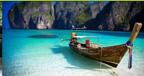
Phi Phi Island