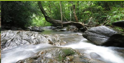
Khao Phra Thaeo Wildlife Sanctuary